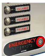
1, 2, 3 or 4 Buttons