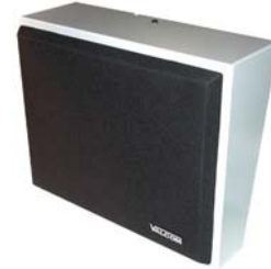
V-1052C Amplified Wall Mount Speaker Gray w/Black Grille

The interior wall speaker, the V-1052C, is a 8" Speaker/Amplifier Assembly capable of reproducing paging as well as back ground music. This speaker has an externally accessible volume control located behind the grille and is screwdriver adjustable. The enclosures are made of steel with a durable powder coated finish. The color of the enclosures can easily be changed to match any decor. A cloth covered detachable grille is included. The speaker requires -24VDC, 50mA (1 power unit).