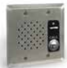
LED VIP-172AL-VRSS* 16 Gauge Steel