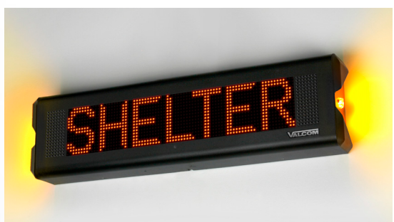
Valcom Speaker-with-Text & Flasher Alerting